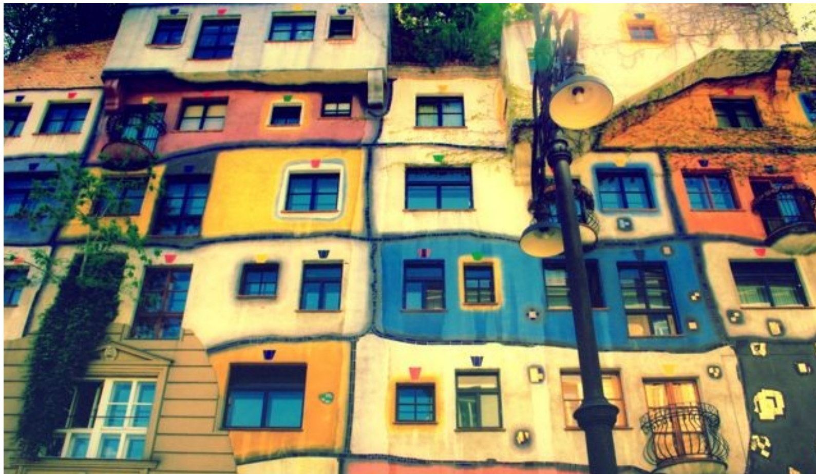
hundertwasser vienna